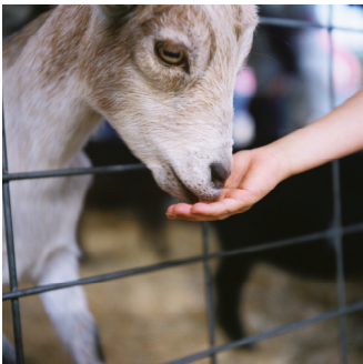
A girl feeds a goat in the petting zoo at the Windsor Fair in Windsor, Maine.

The program will conclude with conversation and refreshments. Copies of The Year of the Goat will be available for purchase and signing.